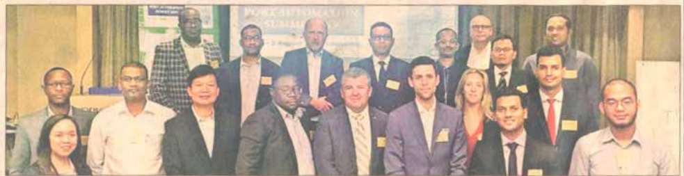
Group picture at the Port Automation summit