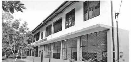
The rebuilt Tissapura Junior School

CSR activities initiated by the port, it was a community service project HIPG undertook during the first phase of their port operations. The school had become derelict and was in urgent need of new usable space as well as repairs to existing infrastructure. HIPG provided them with a new two-storey building equipped with all modern amenities to support learning. A complete overhaul of the old buildings including the installation of drinking water tanks with filtered water pipes, eight new classrooms, staff rooms, a science laboratory, library and a playground were also done, along with the supply of a new roof.