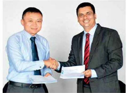
At the signing ceremony of the TSA

THE Hambantota International Port Group (HIPG) recently entered into a Terminal Service Agreement (TSA) with Japanese Shipping Conglomerate NYK, the first RoRo specific TSA entered into by the shipping line with a Sri Lankan Port. Nippon Yusen Kaisha (NYK), whose 130-year history runs parallel to that of its maritime nation, is Japan's largest shipping company and world's no. 1 RoRo fleet operator.