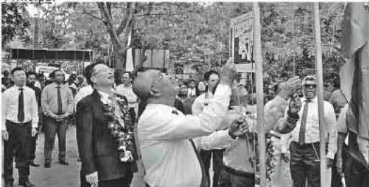
Hoisting of flags at the opening ceremony