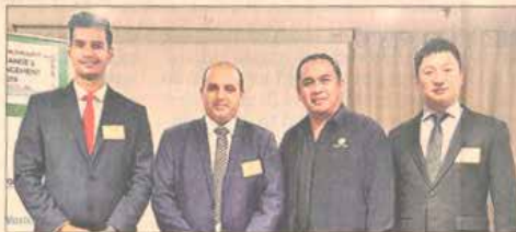
Port Maintenance and Facilities Summit

The Equip Global Port Automation Summit 2019 which was held earlier in the year had also gathered an