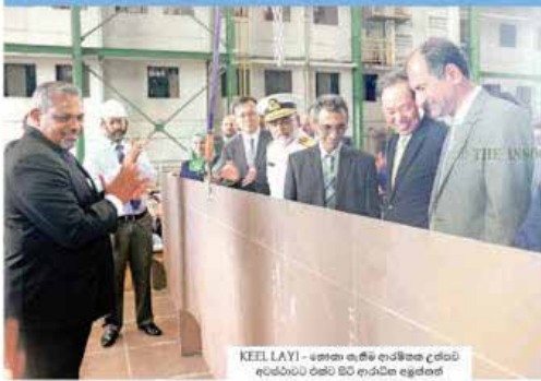
KEEL LAY - නෛමය තැන්පොත් උත්සව අවස්ථාවට එක්ව පිට ආරාධිත පවුල්ගේ