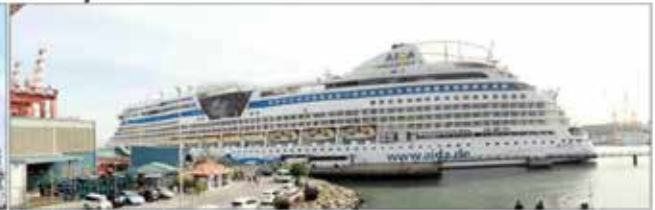
The majestic looking AIDAbliss

in promotional activities on board and look forward to their cooperative support in future."