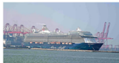
MV Mein Schiff 3 at the Port of Colombo

This ship, Mein Schiff 3 commenced its voyage from Europe during the month of May. She touched many ports in Europe over the last couple of months and thereafter cruised towards South Asia through the Suez Canal touching some ports in the UAE. The vessel cruises under the flag of Malta, called Colombo from Mumbai, India and her next port of call will be Phuket, Thailand.