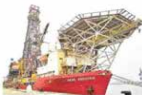
Alongside berthing of drillship Aban Abraham at the Hambantota International Port