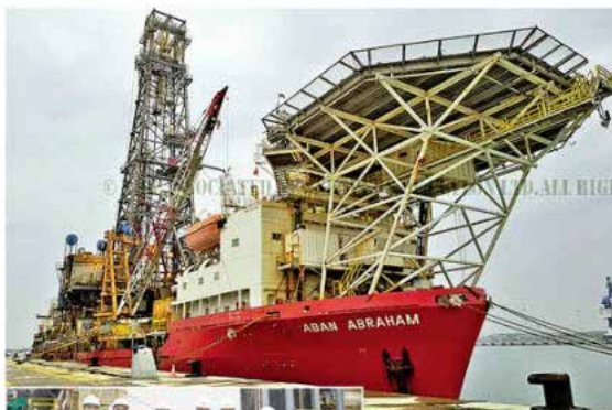
Drillship Aban Abraham berthed at the Hambantota International Port and The Hayleys Energy Services team with drill ship

Heralding Sri Lanka's entry into the global oil and gas marine vessel lay-up services industry, this