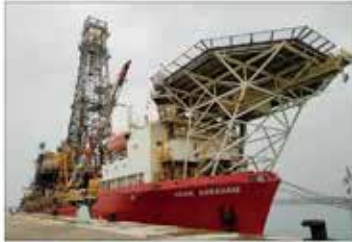
Alongside berthing of drillship Aban Alabram at the Hambantota International Port

Earlier this year, the company successfully completed two projects at the Trincomalee Port Anchorage - the off-loading of the heavy submersible oil rig 'Orinda Star' and provision of anchor services to the heavy lift vessel 'VGP'.