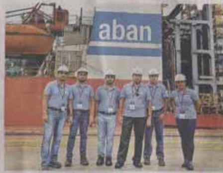
The Hayleys Energy Services team with drill ship Aban Abraham at the Hambantota International Port