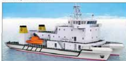
50 m Pilot Station Vessel