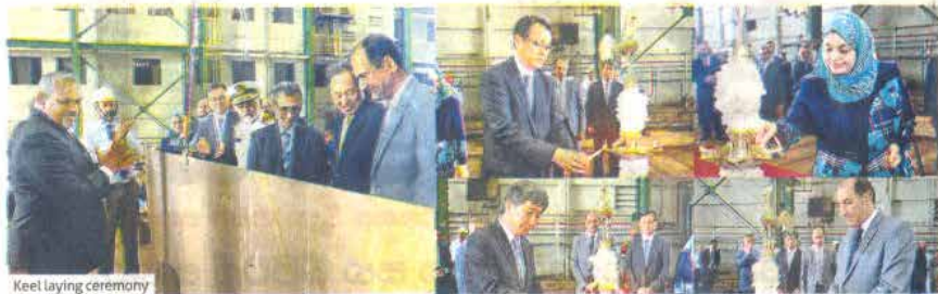
Keel laying ceremony

TTC and GCPI signed the prime contract on 27 April in Dubai for this project and subsequently TTC signed the Sub Contract Agreement with CDPLC as their preferred Shipyard for the construction of these two vessels on 2 May in Japan. Since then the development of the basic design engineering and detailed design engineering took place and from now on, the project will take off the ground with the arrival of steel plates and sections ordered for this project. At a challenging time where there is not much of shipbuilding work taking place in the world due to the recession in the shipbuilding and shipping markets, CDPLC was fortunate to secure this Shipbuilding contract, which will continue till the third quarter of 2020. This project also will be etched