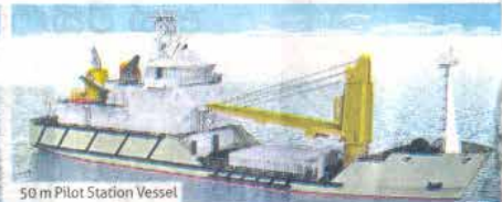
50 m Pilot Station Vessel

in Gold in the annals of shipbuilding history, as the first shipbuilding project from Sri Lanka to reach the Republic of Iraq, who has been one of Sri Lanka's close allies for a number of decades. CDPLC and we as Sri Lankans are happy to contribute with our technology, products and services for the rehabilitation of the Iraq maritime sector.