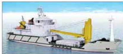
60 m Bouy Tender Vessel

We are confident that with these shipbuilding projects generating from TTC Japan will dawn in a new era in the bilateral economic sphere of