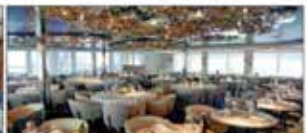
One of the modern star class restaurant areas inside the vessel