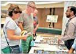
A descriptive explanation Sri Lanka