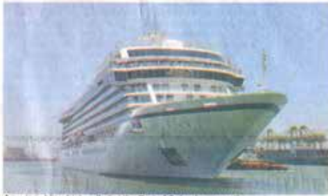
A cruise ship which called at the Port of Colombo, recently.

The Port of Colombo expects to handle 7.8 million containers in 2018, up 13.9% from the 6.8 million TEUs handled in 2017 with joint marketing by three terminals, JCT, SAGT and CICT.