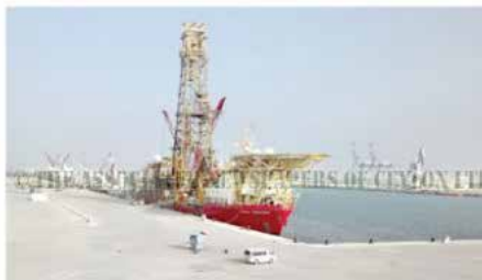
The drillship Aban Abraham docked at the Hambantota International Port.

As per Sri Lanka Ports Authority and Flag requirements, a minimum crew would be on board whilst setting up operations are ongoing. The vessel will be under the supervision of local agents Hayleys Energy Services Lanka (Pvt) Ltd and its marine arm, Maritime Agencies (Pvt) Ltd (HayleysAdvantis Group Companies), during its stay at the port.