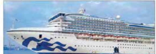
Sri Lanka brochures on display