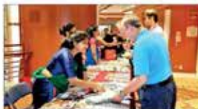
A visitor being briefed by a Tourist Information Centre (TIC) officer of SLTPB in conversation with a passenger