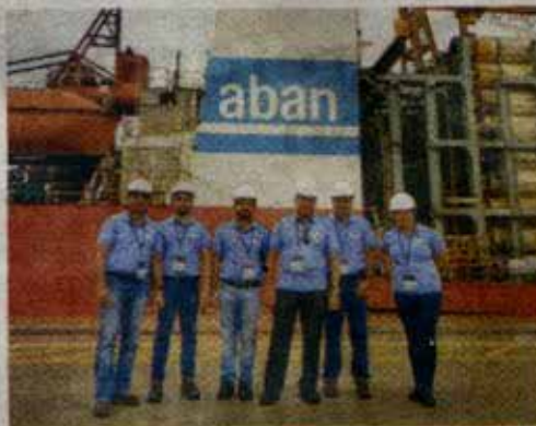
The Hayleys Energy Services team with drill ship Aban Abraham at the Hambantota International Port

"Projects of this nature have a signifi-