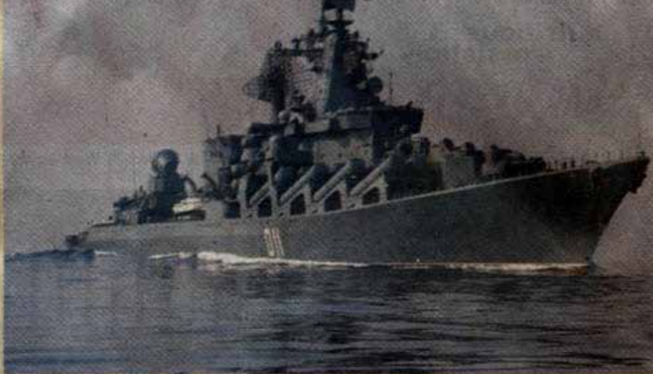
Slava Class missile cruiser Varyag

The Russian Pacific Fleet's Slava Class missile cruiser Varyag is scheduled to arrive in Colombo tomorrow (Dec 20). Varyag will be accompanied by large anti-submarine ship Admiral Panteleyev and Auxillary vessel Boris Butoma . The vessels are scheduled to leave on Dec 24.