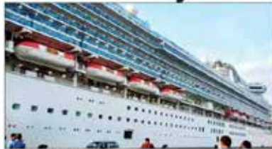
A closer view of the vessel