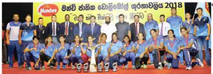
Victorious Air Force team