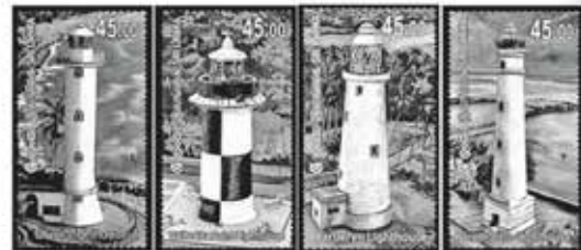
From left: Oluvil, Galibokka (Colombo), Barbery (Beruwa) and Point Pedro

Being an island, lighthouses have been an essential element in Sri