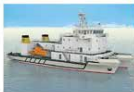
50-metre Pilot Station Vessel.