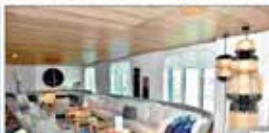
An attractive lounge area inside Le Laperouse