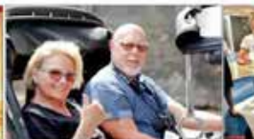
Enjoying a tuk tuk ride