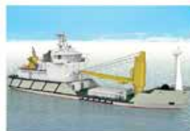
60-metre Buoy Tender Vessel

At a challenging time where there is not much shipbuilding work taking place in the world due to the recession in the shipbuilding and shipping markets, CDPLC was fortunate to secure this shipbuilding contract, which will continue till the third quarter of 2020.