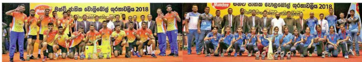
The Munchee Open National Men's (Sri Lanka Ports Authority) and Women's (Air Force) winners.

HIRDARAMANI WIN In the women's Novices category final