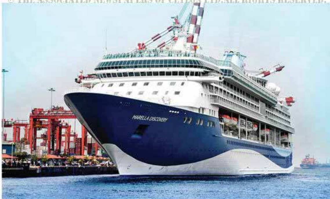
MV Marella Discovery