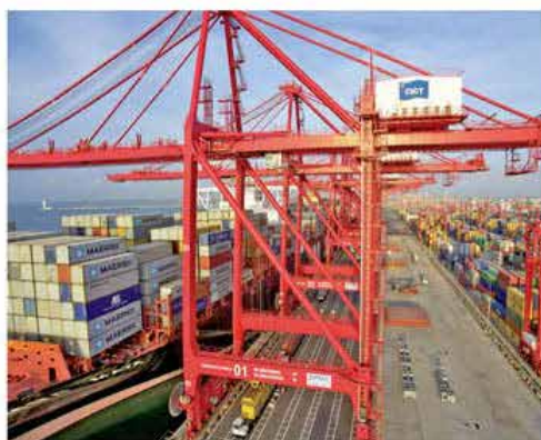
Images taken on the day MSC Maya, the world's largest container ship made its debut port of call in a South Asian port - MSC Maya, Container, Shipping, Sri Lanka, Port, Harbour, ZPMC, Crane

To support the estimated 13 per cent consequent