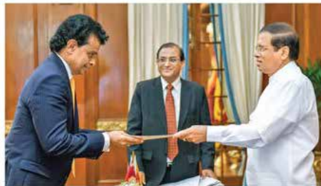
පරාක්‍රම දිසානායක මහතා