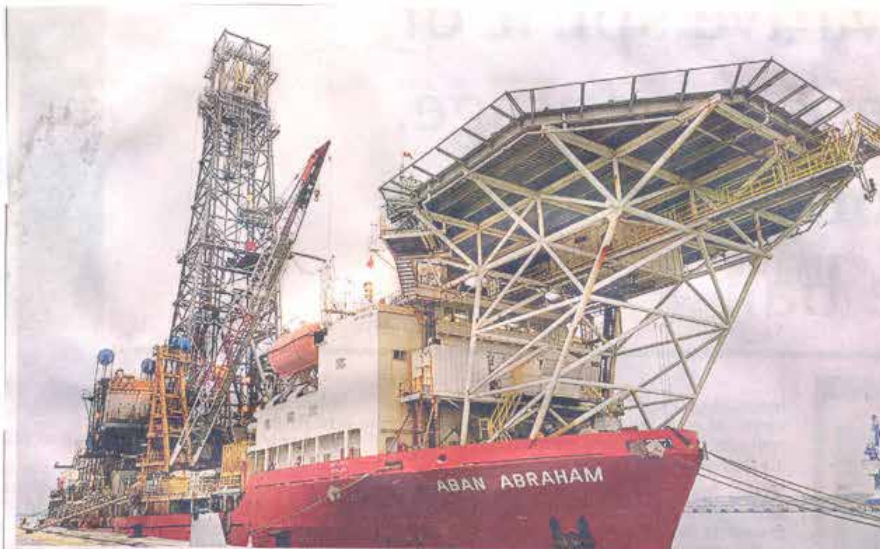
Drillship Aban Abraham berthed at the Hambantota International Port

Newspaper – Sunday Times Date – 23-12-2018