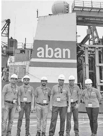
The Hayleys Energy Services team with drillship Aban Abraham at the Hambantota International Port

Newspaper – Sunday Observer Date – 23-12-2018