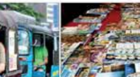
Sightseeing in Colombo in a tuk tuk