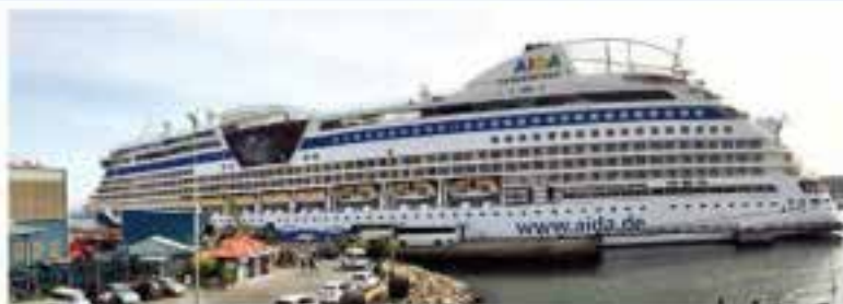
Visitors being briefed by a Tourist Information Centre (TIC) official on the cruise (right) the AIDAbella cruise ship

Sri Lanka tourism is experiencing an increase of cruise liners calling in Colombo and this is attributing to the increase of tourist arrivals. Throughout 2018, Sri Lanka saw the arrival of 53 cruise liners.