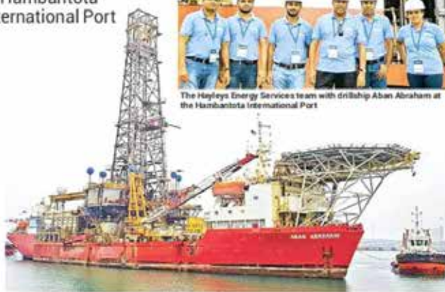
Drillship Aban Abraham berthed at the Hambantota International Port