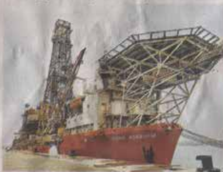
Alongside berthing of drillship Aban Abraham at the Hambantota International Port

"Projects of this nature have a significant impact on the economy as a whole, creating business and employment opportunities beyond the enterprises directly involved in it. The leadership, commitment and world class facilities of the Hambantota International Port Group (HIPG) have been a key factor in the success of this project and will go a long way in helping us attract long-