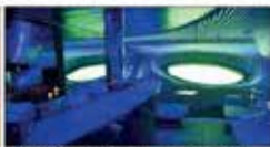
The underwater aqua-restaurant inside Le Laperouse that projects true colour of ocean beneath