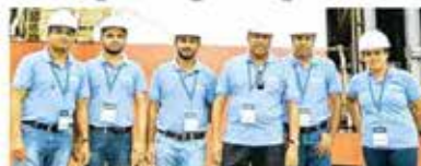
The Hayleys Energy Services team with drillship Aban Abraham at the Hambantota International Port