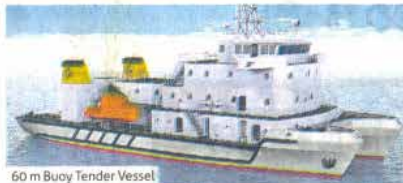
60 m Buoy Tender Vessel