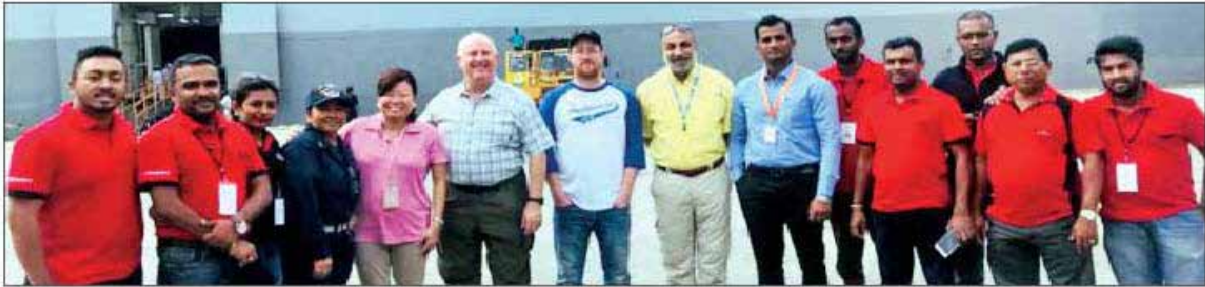
Lanka Shipping and Logistics team with the US Contractors and Support officer of the vessel