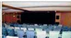
The state-of-the-art theatre auditorium inside the vessel