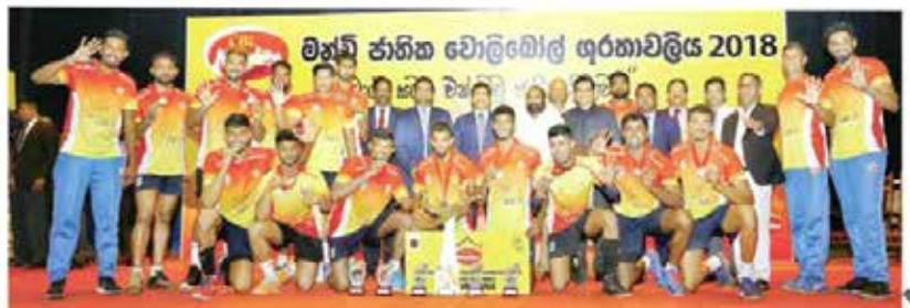
Victorious SL Ports Authority team