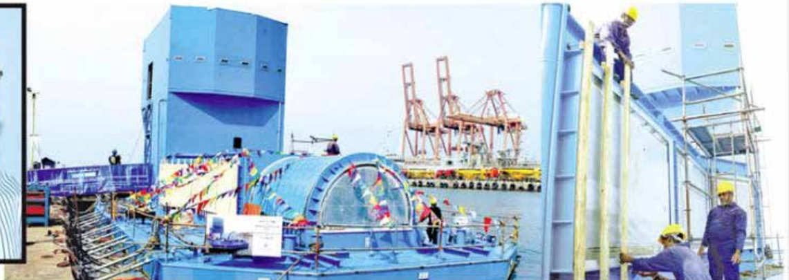
The world's largest underwater restaurant at Colombo Harbour and Workers on board the vessel.