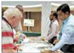
Going through Sri Lanka brochures

Some of the most requested excursions by the passengers included visits to the Pinnawala Elephant Orphanage, Bentota beach, tea plantations, the Delada Maligawa in Kandy and Colombo city tours. There were also 1,100 crew members on board who joined the passengers on these trips.