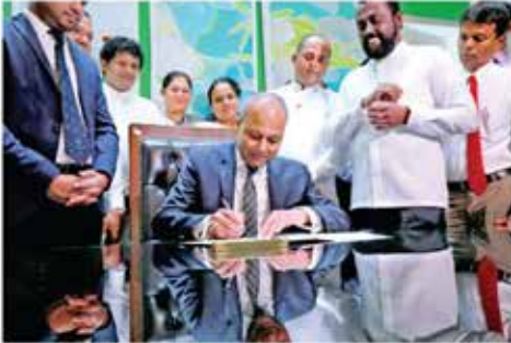
වරාය නංවන්න කෙටි - මධ්‍ය - දිගු කාලීන සංවර්ධන සැලසුමක් ක්‍රියාමත කරනවා

කෙටි කාලයක දී වරාය හා සංවර්ධන ක්ෂේත්‍රය යටට හා පළාත් පාලන මට්ටම වන දෙය