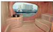
The modern solar facility inside Le Laperouse with a view of part of Port of Colombo