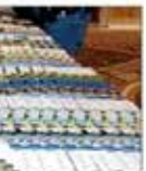
Sri Lanka brochures on display