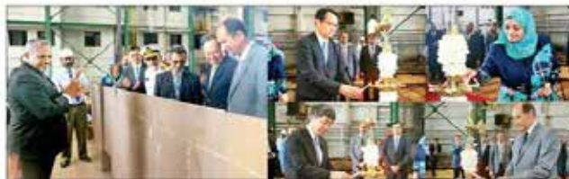
Keel laying ceremony

TTC and GCPI signed the Prime Contract on 27 April in Dubai for this project and subsequently TTC signed the Sub Contract Agreement with CDPLC as their preferred Shipyard for the construction of these two vessels on 2 May in Japan. Since then the development of the basic design engineering and detailed