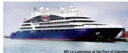
MS Le Laperouse at the Port of Colombo.

The luxury passenger vessel MS Le Laperouse carrying 145 passengers and 113 crew made its maiden call at the Port of Colombo last week.