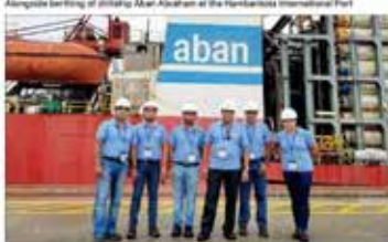
The Hayleys Energy Services team with drill ship Aban Alabram at the Hambantota International Port

Hayleys Energy Services is a subsidiary of Hayleys Advanta Ltd., the transportation and logistics arm of Hayleys PLC. Through the wider logistics offerings of Hayleys Advanta Ltd., the Group caters to diverse logistics needs of its clientele. The company has provided logistics and support services for several projects in the