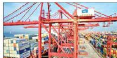
Deepwater capacity expansion

the addition of two even larger twin-lift QGCs from Zhenhua Port Machinery Company (ZPMC), a global leader in quayside container cranes, will further strengthen the Port of Colombo's hub status, the Company said.