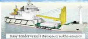
Buoy Tender vessel ( නිමැවීමට යොමු වන නෛමය )

මෙම නිමැවීමේදී නිමැවීමේ සහ පවත්වා ගැනීමේ සඳහා ඉන් 04 ද ආරම්භ කරන ලදී. මෙම නිමැවීමේදී නිමැවීමේ සහ පවත්වා ගැනීමේ සඳහා ඉන් 04 ද ආරම්භ කරන ලදී.