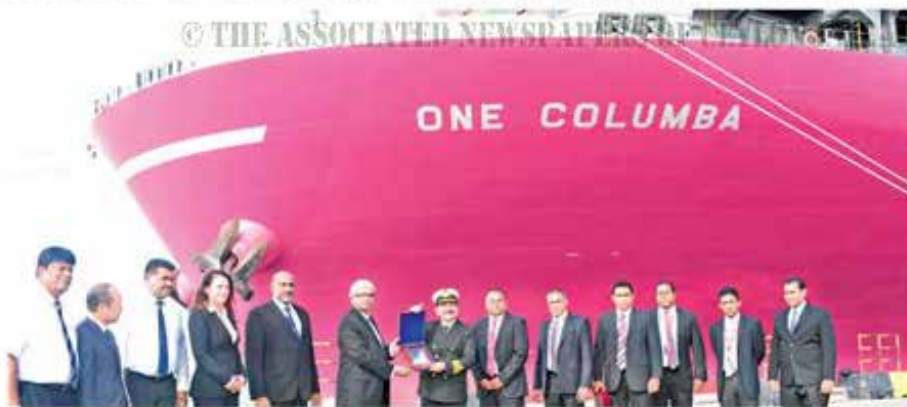
Ocean Network Express and SLPA officials in Colombo Port

ONE is represented in Sri Lanka by Ocean Network Express Lanka (Pvt) Ltd and serves the importers and exporters of Sri Lanka with 8 weekly services to and from the Port of Colombo.