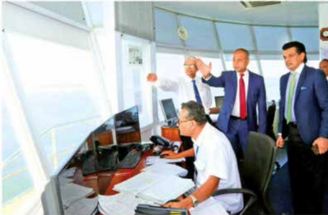
Minister of Ports, Shipping and Southern Development, Sagala Ratnayaka visits Colombo Port

Newspaper – Daily News Date – 31-12-2018