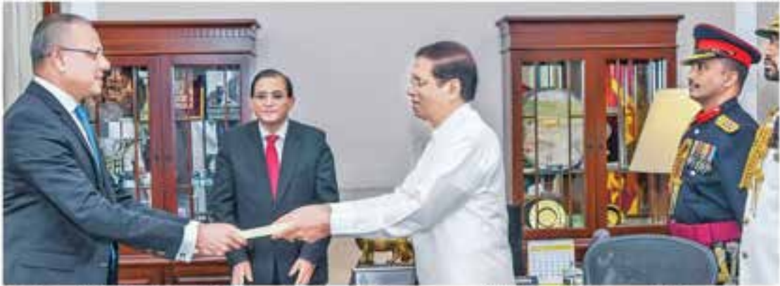
සාගල රත්නායක - විරාය හා නාවික කටයුතු සහ දැක්මින් සංවර්ධන ඇමැති