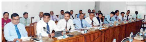
Officials of SLPA and SLC with the members of CASA and SLAVO at the meeting

At present, the Management Committee of Sri Lanka Ports Authority has approved the zero toler-