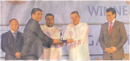
Feeder Operator Category 5th place: Orient Express Lines-Singapore

The gala Port of Colombo Awards Night organised by Sri Lanka Ports Authority (SLPA) in collaboration with the Jaya Container Terminal (JCT), South Asia Gateway Terminals (SAGT) and the Colombo International Container Terminals (CICT) for the first time, was held on July 23, 2018, at the Shangri-La Hotel, Colombo.