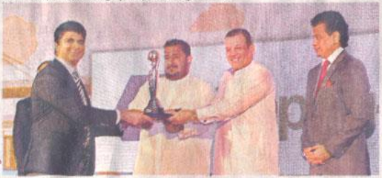
Mainline Operations Category 5th place: Hapag-Lloyd