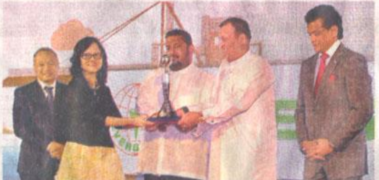
Mainline Operations Category 4th place: Evergreen Line