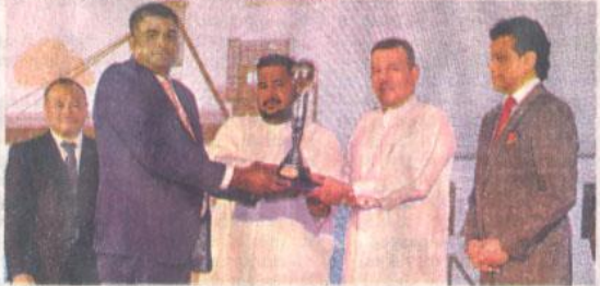
Mainline Operations Category 2nd place: Maersk Line