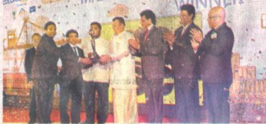
Mainline Operations Category 1st place: Mediterranean Shipping Company