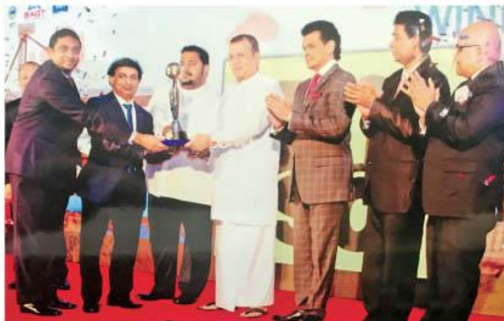
Ports and Shipping Minister Mahinda Samarasinghe presenting an award to a recipient, while others look on.