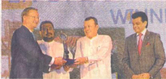
Feeder Operator Category 2nd place: Bengal Tiger Lines