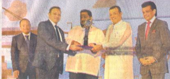
Feeder Operator Category 1st place: X-Press Feeders