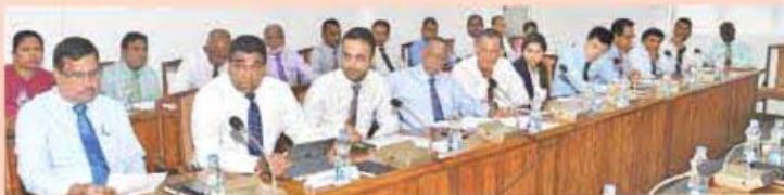
Officials of the Sri Lanka Ports Authority (SLPA), Sri Lanka Customs (SLC) with the members of the Ceylon Association of Shipping Agents (CASA) and members of Sri Lanka Association of Vessel Operators (SLAVO) at the meeting