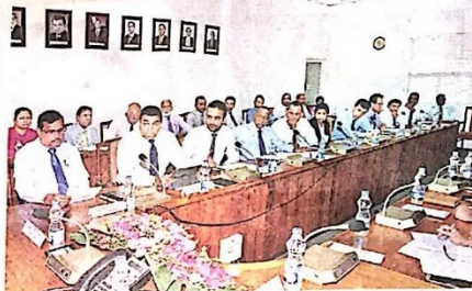
Officials of the SLPA and SLC with the members of CASA and SLAVO at the meeting

non-presence of the exporter and forged documentation, containers have been detained by relevant authorities for further investigation. A joint decision was reached at the meeting to establish a committee comprising of officials of Sri Lanka Ports Authority (SLPA), Sri Lanka Customs (SLC), Ceylon Association of Shipping Agents (CASA) and Sri Lanka Association of Vessel Operators (SLAVO) to look into the matter. The committee will submit a