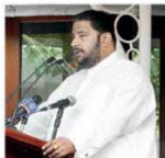
Acting Minister of Ports and Shipping Nishantha Muthuhettigama speaking at the occasion