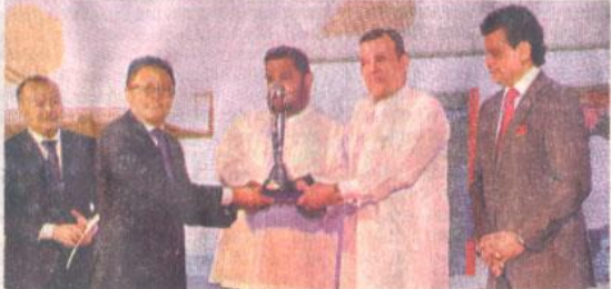
Mainline Operations Category 3rd place: CMA CGM