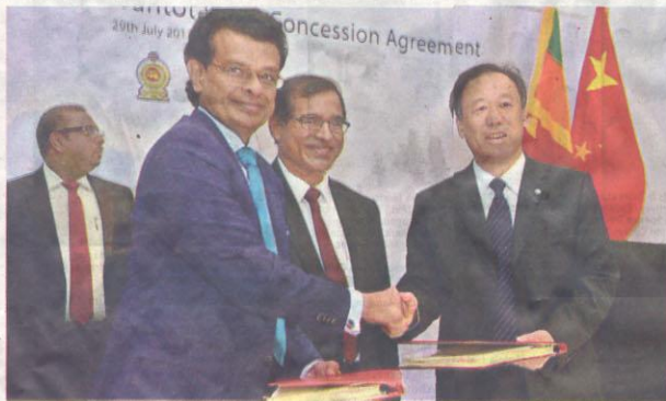
Chinese and Sri Lankan authorities shake hands during the Hambantota International Port Concession Agreement signing ceremony in Colombo, on July 29, 2017.

Under this deal, the Chinese side holds a 70-percent stake in two joint ventures and the Sri Lankan side holds the rest 30 percent. After 10 years, the Sri Lankan side will gradually purchase an additional 20 percent stake, resulting in the two sides owning an equal share of 50 percent each.