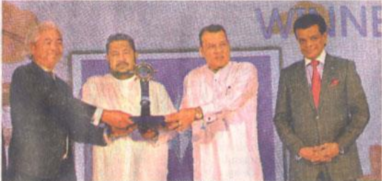
Feeder Operator Category 3rd place: Far Shipping Singapore