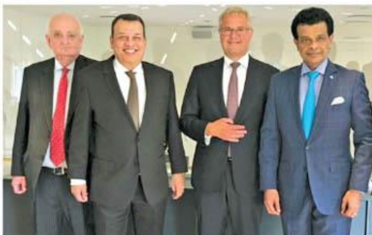
Minister Mahinda Samarasinghe with Denmark delegates.