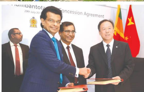
File Photo: Hambantota Concession Agreement signing event 2017.

But some critics said, "Look! Only 34 vessels docked in 2012. With tens of thousands of