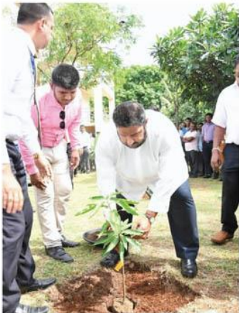
ඇමැති මුතුහෙට්ටිගම මහතා වරාය සම්බුද්ධත්ව ජයන්ති පරිශ්‍රයේ පාලයක් රෝපණය කළ අයුරු.

ශ්‍රී ලංකා විරාය අධිකාරිය මෙරට ආර්ථිකය තංචිමේ ප්‍රධාන මරණස්ථානයක් ලෙස සිය කාර්යය මැනවින් ඉටුකරමින් සිටින බව විරාය හා නාවික වැඩබලන ඇමති නිකාන්ත මුතුහෙට්ටිගම මහතා පැවසීය.