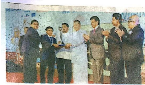
කොළඹ වරාය සම්මාන රාත්‍රිය වරාය