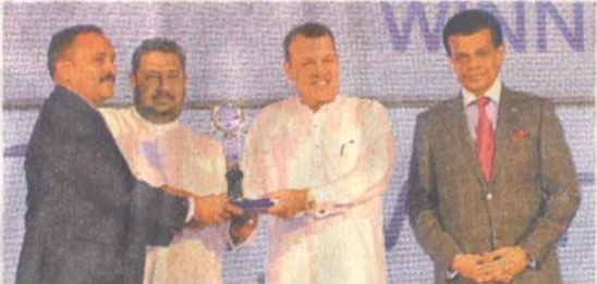
Feeder Operator Category 4th place: Transworld Feeders