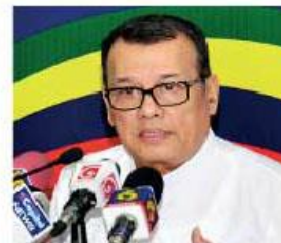
Ports and Shipping Minister Mahinda Samarasinghe

the ECT was to be managed as a Public-Private Partnership, subject Minister Mahinda Samarasinghe, speaking at a press conference held at the Sri Lanka Freedom Party Head Office yesterday, said that the Cabinet has given approval for the Terminal to be managed by the Ports Authority.