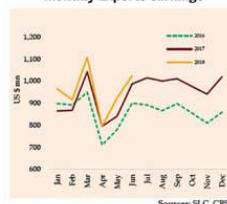
Monthly Exports earnings

The deficit in the trade account continued to expand in June 2018 in comparison to June 2017, driven by the higher growth in imports. On a cumulative basis, the trade deficit